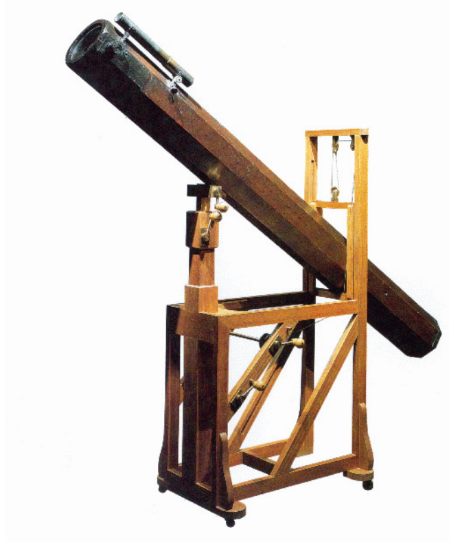
Figure 4.1: Herschels first telescope.