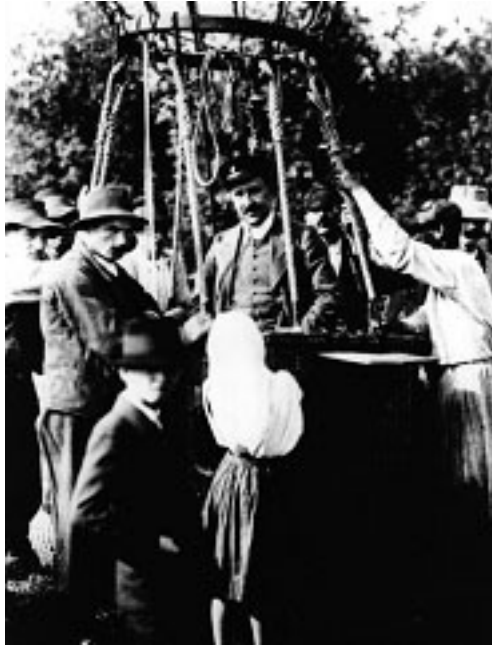
Figure 2.2: Victor Hess just before his famous balloon flight.

But Victor F. Hess was the first to make some important breakthroughs and show that this source must be cosmic in origin. For his work he was awarded the Nobel Prize in Physics in 1936.